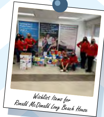
Wishlist Items for Ronald McDonald Long Beach House

Credit Union Staff and members collected items on the "Wishlist" for the Ronald McDonald Long Beach House