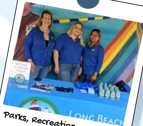
Parks, Recreation and Marine Training Session

We brought lunch and connected with new employees for the City of Long Beach Dept. of Parks, Recreation and Marine during their training session.