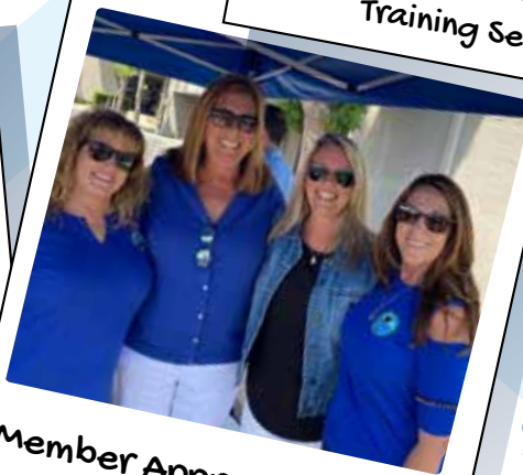
Member Appreciation Day

We greeted and provided water and snacks at City of Long Beach's "Gratitude Walk" at the El Dorado Nature Center.