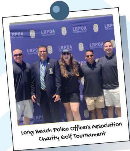
Long Beach Police Officers Association Charity Golf Tournament

Your CU Crew was on-site to welcome Long Beach Public Works employees to their Annual Breakfast to show our appreciation for all they do for the residents of Long Beach. Thanks for keeping our city beautiful!