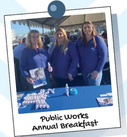
Public Works Annual Breakfast

Your CU Crew brought donuts to twelve Long Beach libraries and the City of Signal Hill library for National Library Workers Day on Tuesday, April 9, to show our appreciation for all they do to promote literacy in our communities.