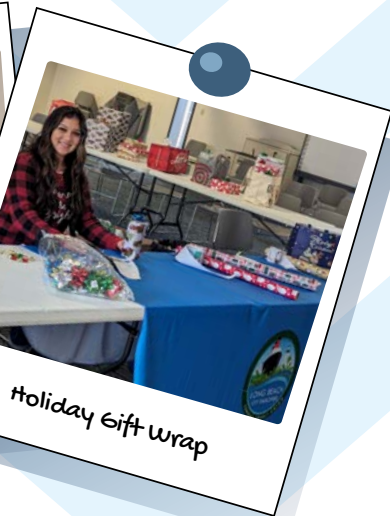
Holiday Gift Wrap

And we helped wrap hundreds of gifts for City Employees at our annual Holiday Gift Wrap events around the city. We visited City Hall, the Port of Long Beach, Emergency Operations Center, LBPD Headquarters, DHHS Headquarters, and LB Utilities!