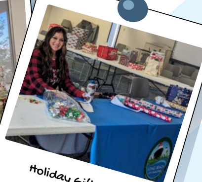
Holiday Gift Wrap