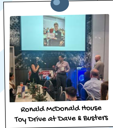
Ronald McDonald House Toy Drive at Dave & Busters

We were on hand with Long Beach Management Association to help prepare their dinner for the families staying at the Ronald McDonald House (RMH). Their Toy Drive for RMH at Dave & Busters was a huge success!