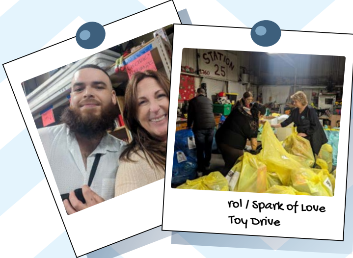
rol / Spark of Love Toy Drive

We assembled gift bags with the Long Beach Police Department and Long Beach Fire Department for their annual Toy Patrol / Spark of Love Toy Drive. We supported the employees and volunteers in collecting toys for deserving children in the community.