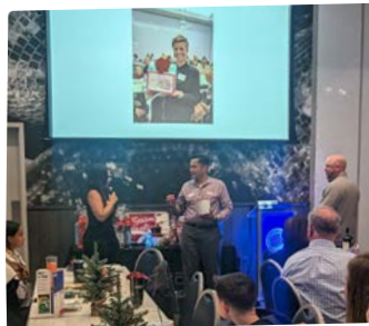
Ronald McDonald House Toy Drive at Dave & Busters

And we helped wrap hundreds of gifts for City Employees at our annual Holiday Gift Wrap events around the city. We visited City Hall, the Port of Long Beach, Emergency Operations Center, LBPD Headquarters, DHHS Headquarters, and LB Utilities!