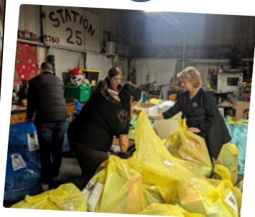
rol / Spark of Love Toy Drive

We assembled gift bags with the Long Beach Police Department and Long Beach Fire Department for their annual Toy Patrol / Spark of Love Toy Drive. We supported the employees and volunteers in collecting toys for deserving children in the community.