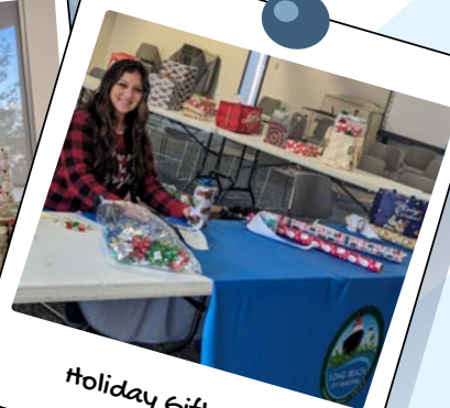
Holiday Gift wrap