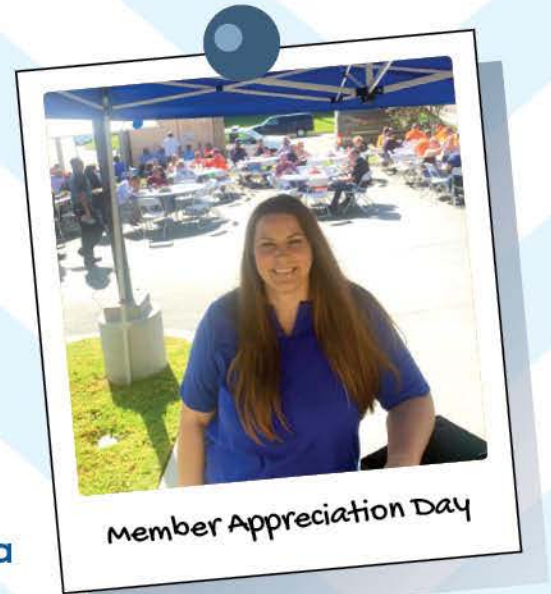
Member Appreciation Day